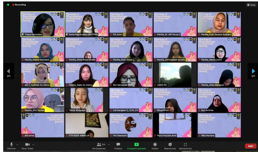
Photo 1 & 2: Participants in The Role of Physiotherapy in Maternity Setting by colleagues from Indonesia